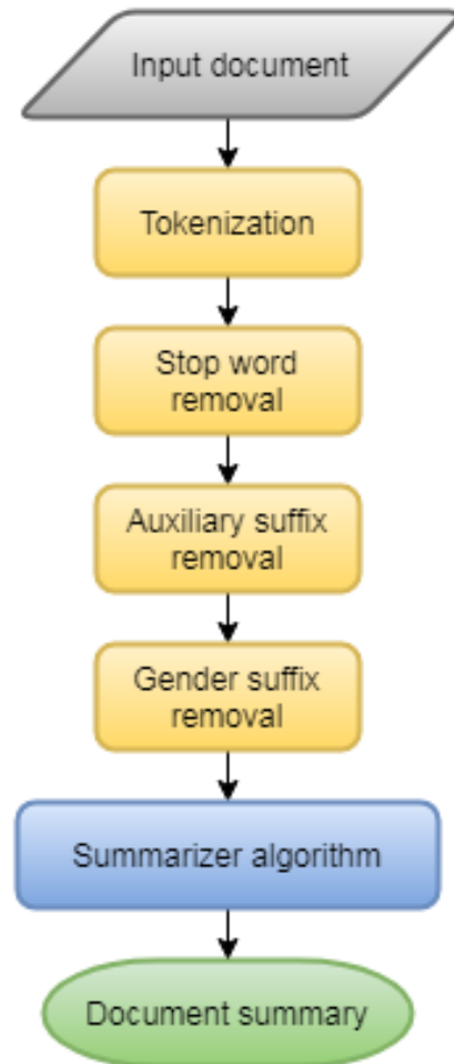
Figure. 1: Block diagram of the extractive text summarization architecture

Two different methods are proposed and analyzed in this paper- the first one is the use of singular value decomposition (SVD) strategy as a part of the latent semantic analysis (LSA) approach, while the second is the use of fuzzy logic and rules for deciding the ranking mechanism. Figure 1 shows the block diagram of the extractive text summarization architecture. Note that two different solutions are presented for the summarizer algorithm phase.