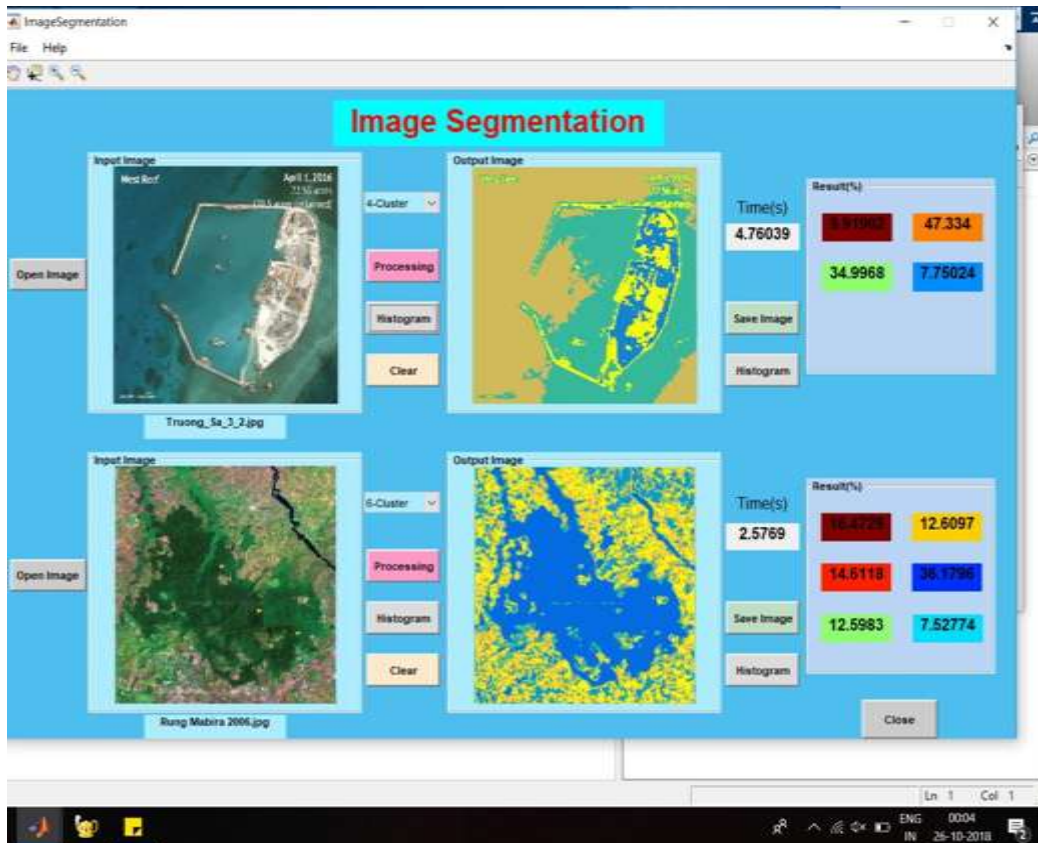
Figure 1. Test Satellite Image